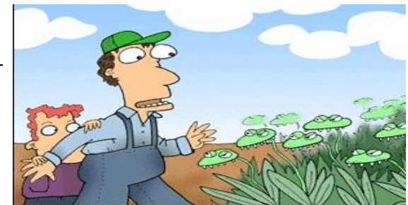
Thanks to Warren I HAVE A FEELIN' THOSE SEEDS WE PLANTED WEREN'T SEEDS OF KINDNESS AFTER ALL