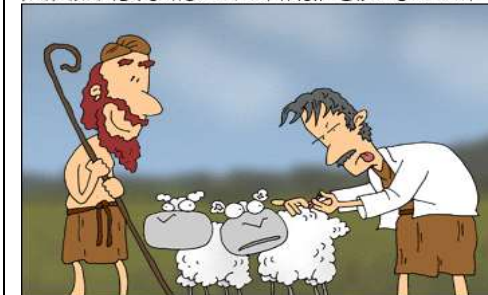
(See John 10:1-18) THE GOOD SHEPHERD HAVING HIS SHEEP MICROCHIPPED 07-07-2008